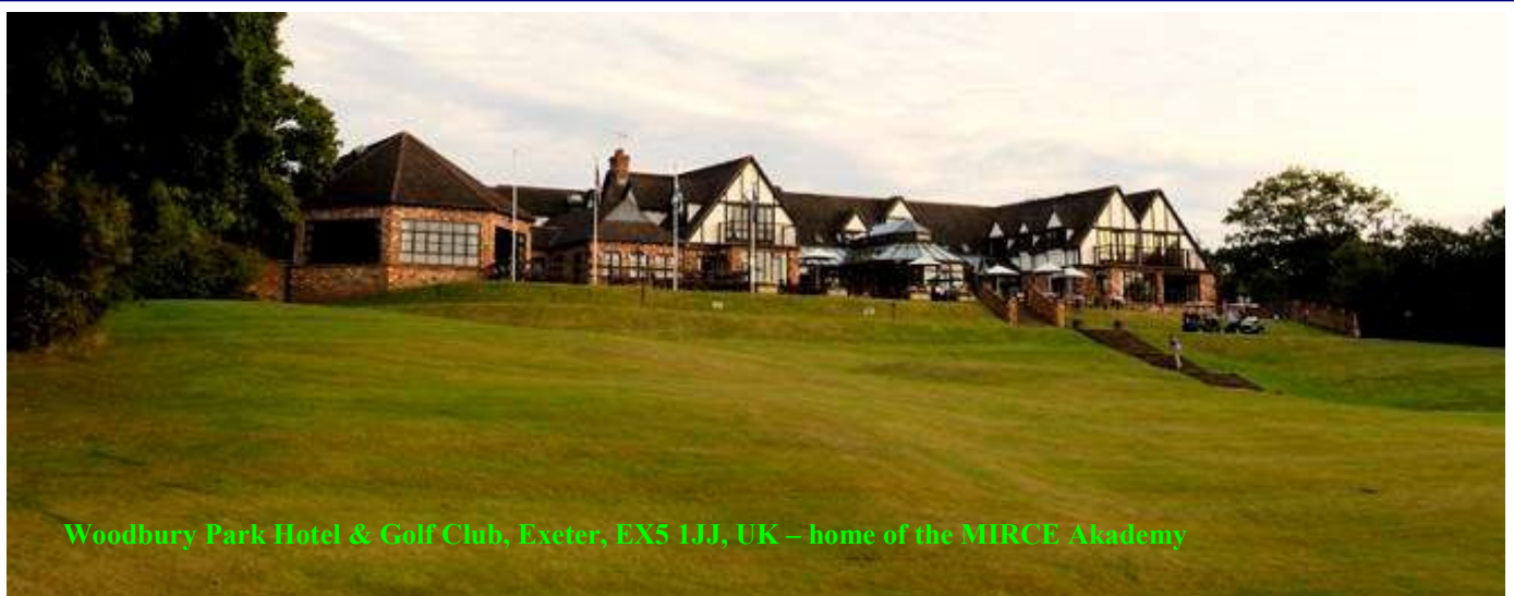
Woodbury Park Hotel & Golf Club, Exeter, EX5 1JJ, UK – home of the MIRCE Akademy

Phone: + 44 (0) 1395 233 382 Email: office@mirceakademy.com Web: www.mirceakademy.com