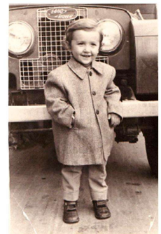
The Origin of MIRCE Science